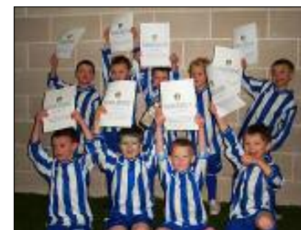
Lepton Junior FC in their new kits funded by a Parish Council grant